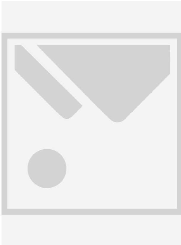
Image Credit: Book cover from Perfect Imperfect by Karen McCartney, 2016.

Perfect Imperfect combines ceramics, art and sculptural pieces, textiles, photography and found objects to form one cohesive study of imperfection.