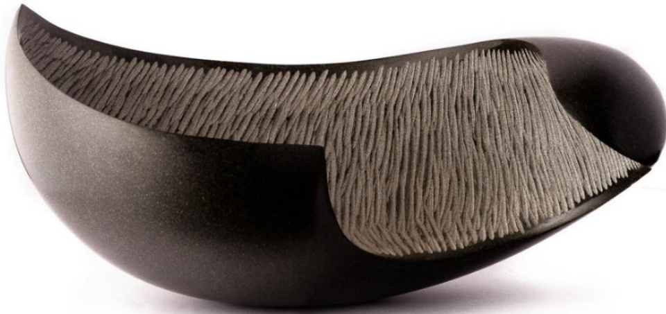
Image: Title: aeon . Materials: Basalt . Artist: Senden Blackwood . Dimensions: 16cm x 30.5cm x 25.5cm