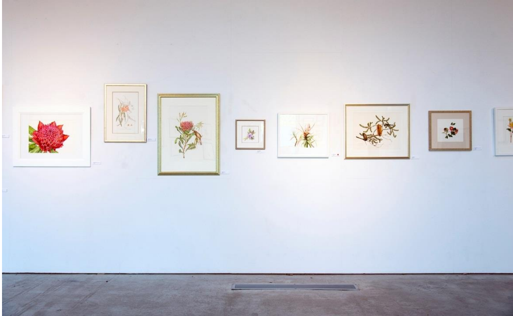
Image: last year's exhibition in Nishi Gallery

A repeat exhibition from last year's program with minor curatorial changes.