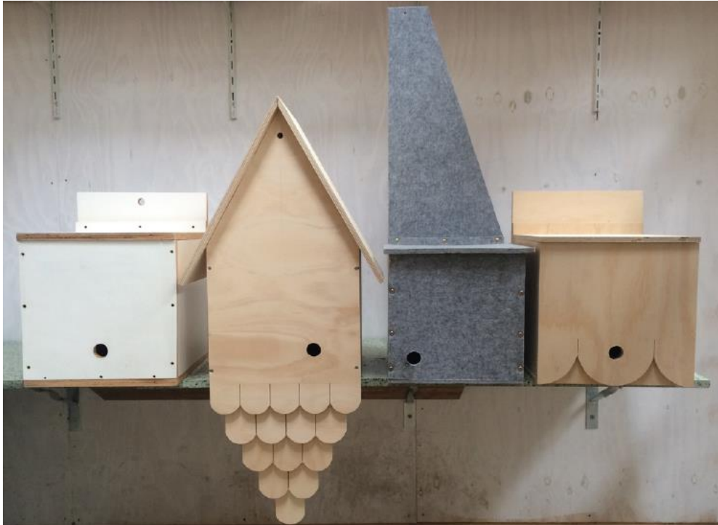
Image Credit: Swarm Traps built by Honey Fingers in collaboration with Many Many, 2015.

to catch and protect wild swarms before bees set up in inappropriate places and the pest controller is called in. To raise awareness of the plight of the honey bee and to encourage backyard beekeeping, exhibition curators Honey Fingers and Many Many have invited a selection of architects, designers, craftspeople, fashion designers, illustrators, artists and beekeepers to design and make their own swarm traps - the results forming this exhibition. After the objects have been displayed together in the gallery context the swarm traps will be installed out in the city and the bush as a part of a two-year documentation project.