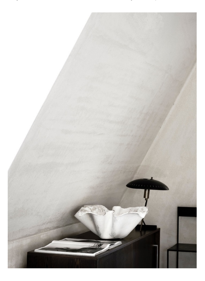
Image Credit: Book cover from Perfect Imperfect by Karen McCartney, 2016.

Perfect Imperfect combines ceramics, art and sculptural pieces, textiles, photography and found objects to form one cohesive study of imperfection.