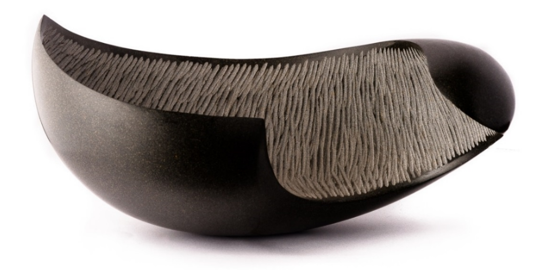
Image: Title: aeon. Materials: Basalt. Artist: Senden Blackwood. Dimensions: 16cm x 30.5cm x 25.5cm