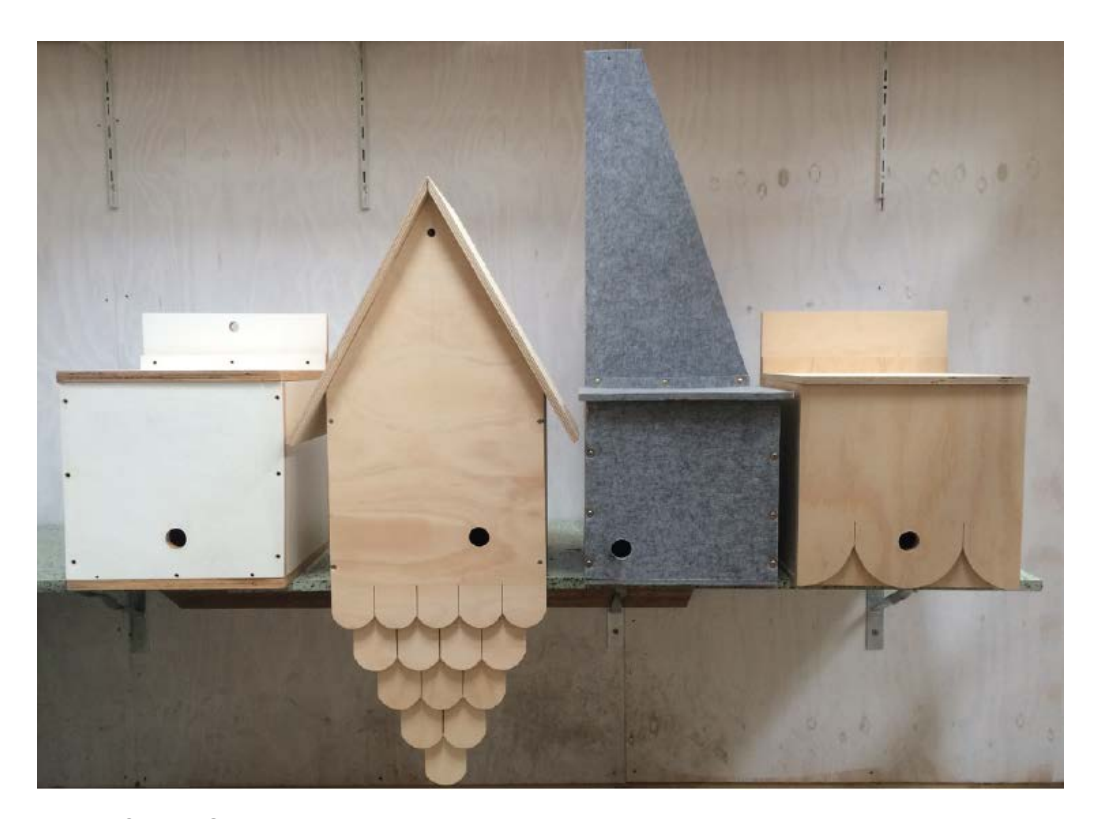
Image Credit: Swarm Traps built by Honey Fingers in collaboration with Many Many, 2015.

to catch and protect wild swarms before bees set up in inappropriate places and the pest controller is called in. To raise awareness of the plight of the honey bee and to encourage backyard beekeeping, exhibition curators Honey Fingers and Many Many have invited a selection of architects, designers, craftspeople, fashion designers, illustrators, artists and beekeepers to design and make their own swarm traps - the results forming this exhibition. After the objects have been displayed together in the gallery context the swarm traps will be installed out in the city and the bush as a part of a two-year documentation project.